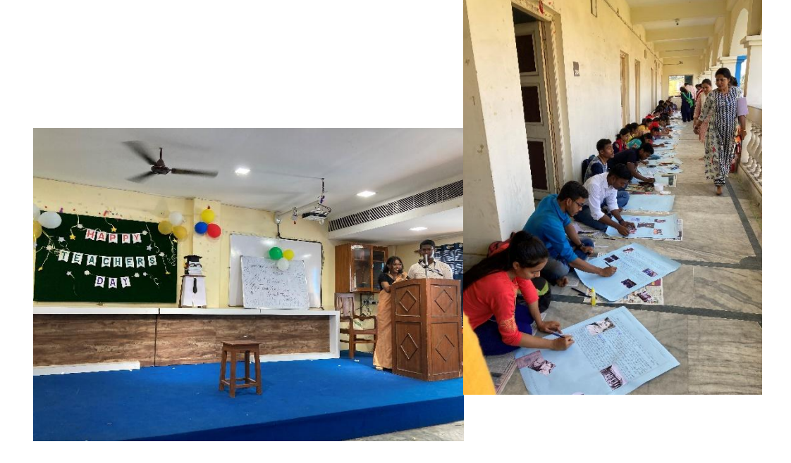
Stage ready to celebrate Teachers' Day 2022